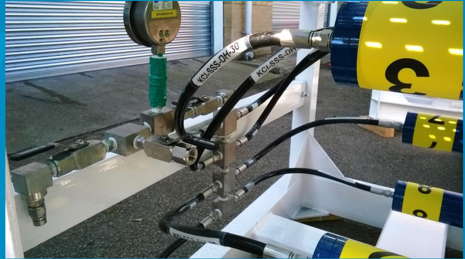
Skid Manifold & Pipework. (Corrosion protection in green)